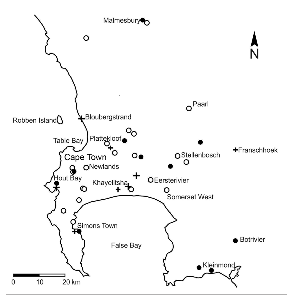
Figure 1. Results of molecular tests for the presence of Emergomyces africanus in soil samples in relation to residential locations of 14 patients diagnosed with emergomycosis (6), Cape Peninsula, Western Cape Province, South Africa. Black circles indicate Es. africanus detected in soil sample; white circles indicate Es. africanus not detected in soil sample; plus signs indicate residential locations of patients with emergomycosis. A larger cross indicates >1 infected patient at that particular location.

resembling Es. africanus (1). This preparation also resulted in rapid contamination of all plates.