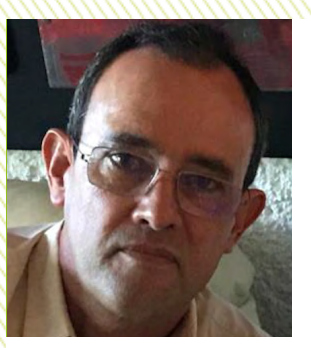
Dr Mario Soberón Institutio de Biotecnología, UNAM

Two different models for the mechanism of action of Cry toxins have been proposed, the signal transduction model (STM) or the sequential step model (SSM). In the case of STM, binding of Cry toxins to a membrane bound receptor, cadherin, triggers a G-protein dependent cascade that causes programed cell death. The SSM proposes that cell death is triggered by pore formation activity of the protein which results from sequential steps of the toxin, all of them assisted by receptor binding such as, concentration of toxin in the membrane, toxin oligomerization and oligomer insertion into the membrane. A fundamental difference between both models is that toxin oligomerization is a fundamental step for the SSM, while is not for the STM. We will summarize the experimental evidence that lead to both models and the experimental evidence that shows that toxin oligomerization is essential. Also, the role of ABCC2/3 in the mode of action of Cry proteins and its synergistic interaction with cadherin inducing Cry toxicity will be discussed in the context of the SSM.