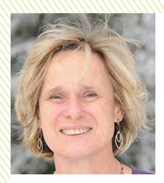
Dr Ann E.Hajek Cornell University

In our model, not all epizootics maximized the biocontrol. The fungus transmission efficiency, the humidity threshold triggering fungal sporulation and the weather (temperature and relative humidity) were crucial to explain yield loss. The fungus inoculum quantity was only moderately important. Finally, the cadaver prevalence at the beginning of flowering and milk stage gave an indication of the final biocontrol level.