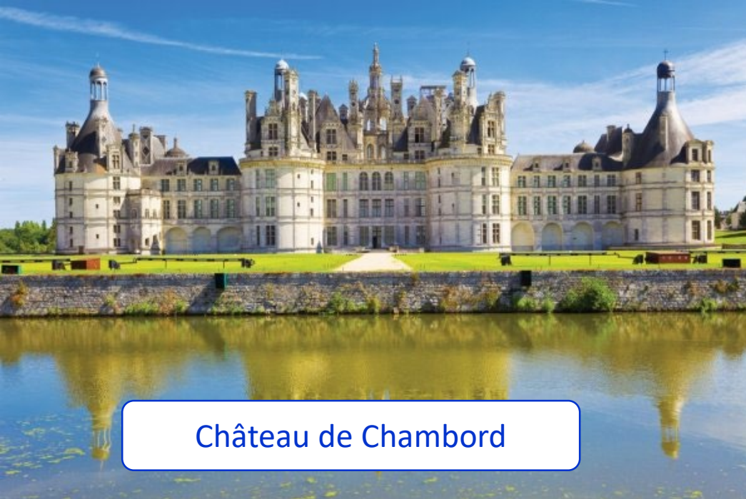
Château de Chambord