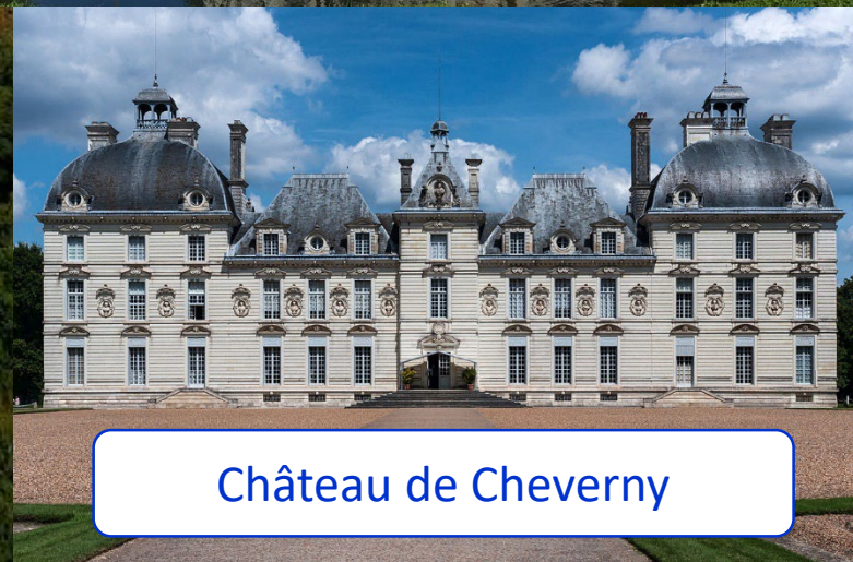
Château de Cheverny