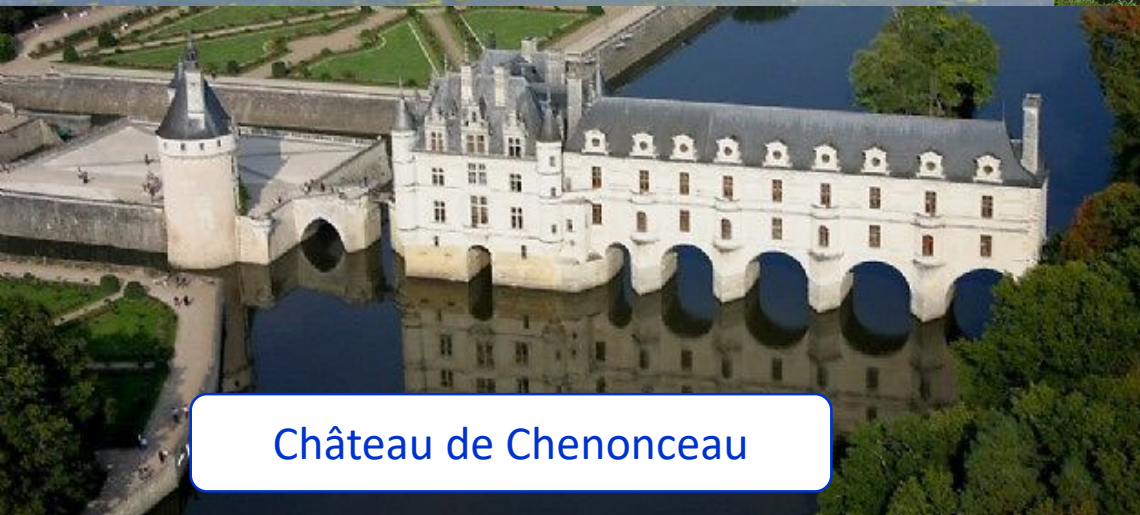
Château de Chenonceau