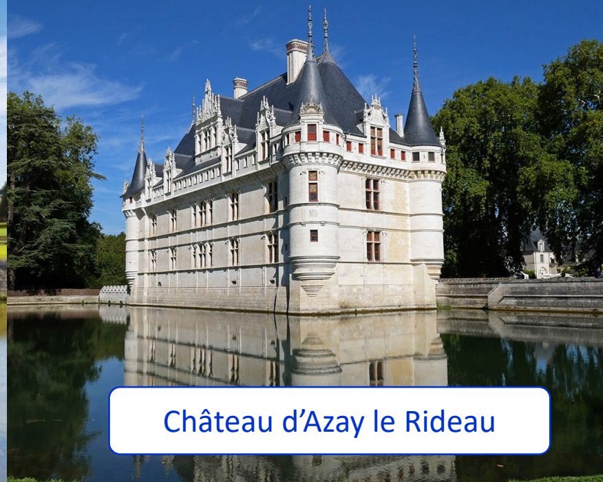
Château d'Azay le Rideau