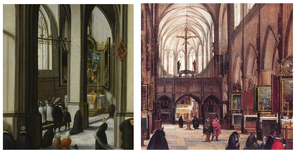
Fig.1 Hendrick van Steenwijck (I), Innenraum einer mittelalterlichen Kirche , ca. 1585, oil on canvas, 90,5 x 121 cm, Hamburger Kunsthalle, inv. HK-196

Fig.2 Hendrik van Steenwijk and Jan Brueghel, Interior of the cathedral of Our Lady (detail), 1583 or 1593, oil on panel, 452 × 625 mm, Budapest, Museum of Fine Arts, inv. 579